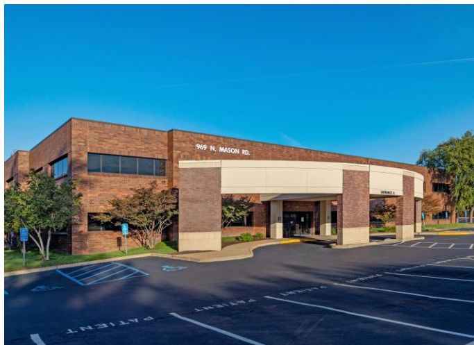
MEDICAL OFFICE BUILDING 969 • 969 North Mason Road