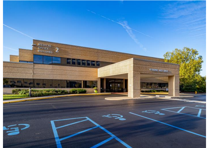
MEDICAL OFFICE BUILDING 2 • 10 Barnes West Drive