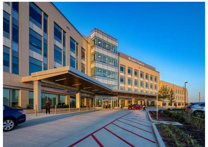
BARNES-JEWISH WEST COUNTY HOSPITAL • 12634 Olive Blvd.