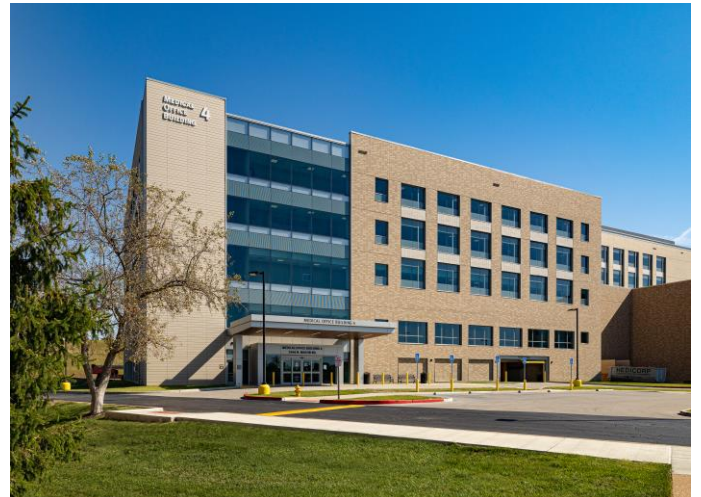
MEDICAL OFFICE BUILDING 4 • 1044 North Mason Road