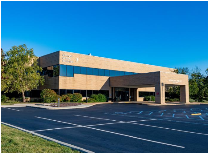
MEDICAL OFFICE BUILDING 3 • 1020 North Mason Road