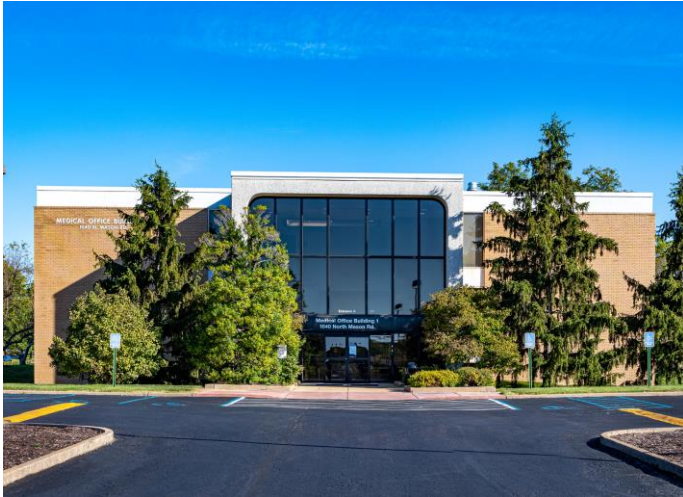
MEDICAL OFFICE BUILDING 1 • 1040 North Mason Road